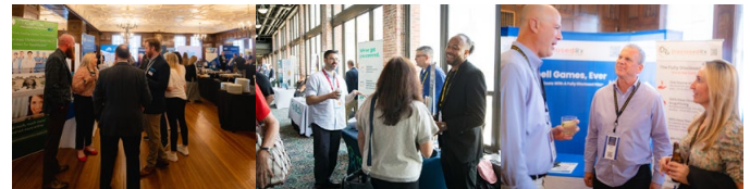
Exhibit booths & resources in mobile app.