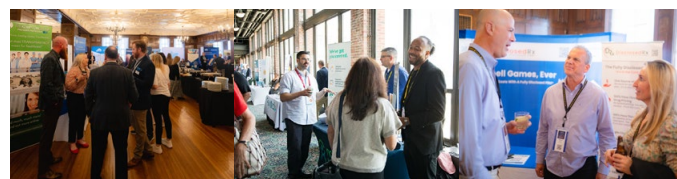
Exhibit booths & resources in mobile app.